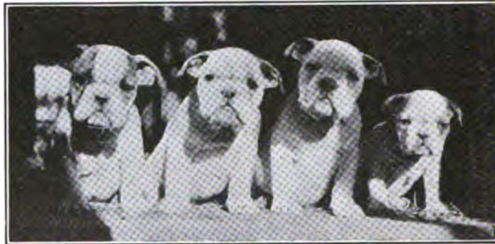
SILENT WHITE PRISCILLA, S. W. FLAME, S. W. MARCIA, S. W. ELIZABETH, AT EIGHT WEEKS. SIRE, CH. SILENT WHITE DUKE EX ASTORIA RUTH LAW, BY CH. ASTORIA BARON. BREEDER, THE FARM OF THE SILENT WHITE BULLDOGS, REG., PIKEVILLE, MD.